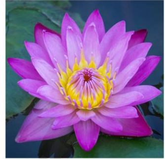
BLUE WATER LILY